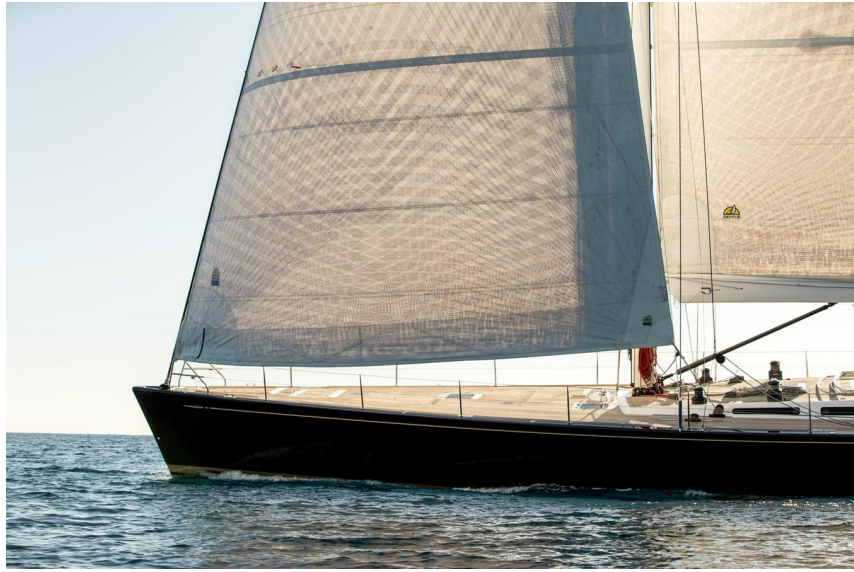
Racing St. Barth's